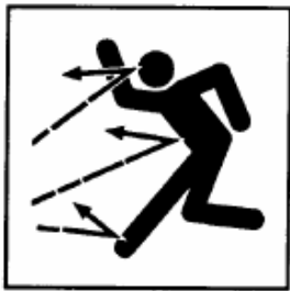
Figure 3.1.e. Mowers are a frequent source of thrown objects.