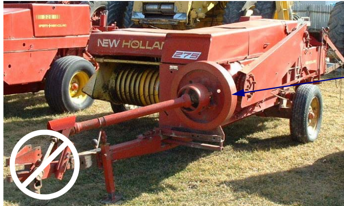
Figure 3.1.d. The flywheel on a small square baler is an example of a freewheeling part. The flywheel keeps the baler running smoothly if a large amount of hay is suddenly taken into the bale chamber. Notice that part of the PTO driveline is unguarded.

To avoid injury from freewheeling parts, stop the tractor engine, disengage the PTO, and wait for the machine to stop completely before making repairs or adjustments.