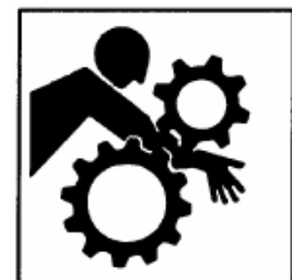
Figure 3.1.c. Pull-in points are found on harvesting machinery.

Awareness is the best protection from hazards that cannot be eliminated or shielded.