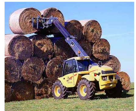
Figure 3.1.f. Hydraulic systems often have stored energy.

Avoid the hazard of stored energy by knowing which parts which may be spring loaded. Relieve hydraulic system pressure when the job is completed. Ask for a demonstration of where you might encounter this potential hazard.