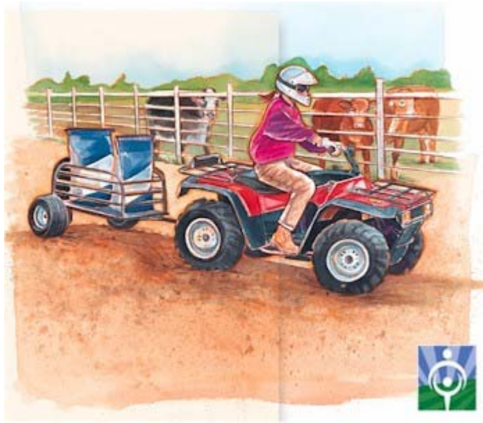
Figure 2.4.b. Taking chances with motorized vehicles may be fun, but the odds of an injury or death increases greatly when risky behavior is substituted for correct operation of ATVs, dirt bikes, and tractors.

Physical growth can lead youth to believe that they can do more than they can mentally handle.