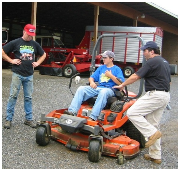
Figure 2.4.e. Youthful workers assigned to supervised tasks can learn safe, productive agricultural work habits. The NAGCAT Guidelines help parents and employers determine what tasks are appropriate.

Guidelines for age-appropriate tasks are useful tools and can lead to mature actions of the safety-conscious youthful worker.