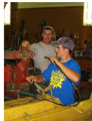
Figure 2.4.a. Young people sometimes want to do everything an adult does.

All of us go through growth phases. Our physical and mental maturity may not match our work assignment.