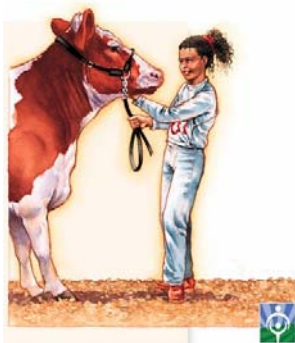
Figure 2.4.c. Young muscles and joints may be strained and sprained trying to move heavy loads. Animals pose their own special risks in being moved as well.

Physical growth can lead youth to believe that they can do more than they can mentally handle.